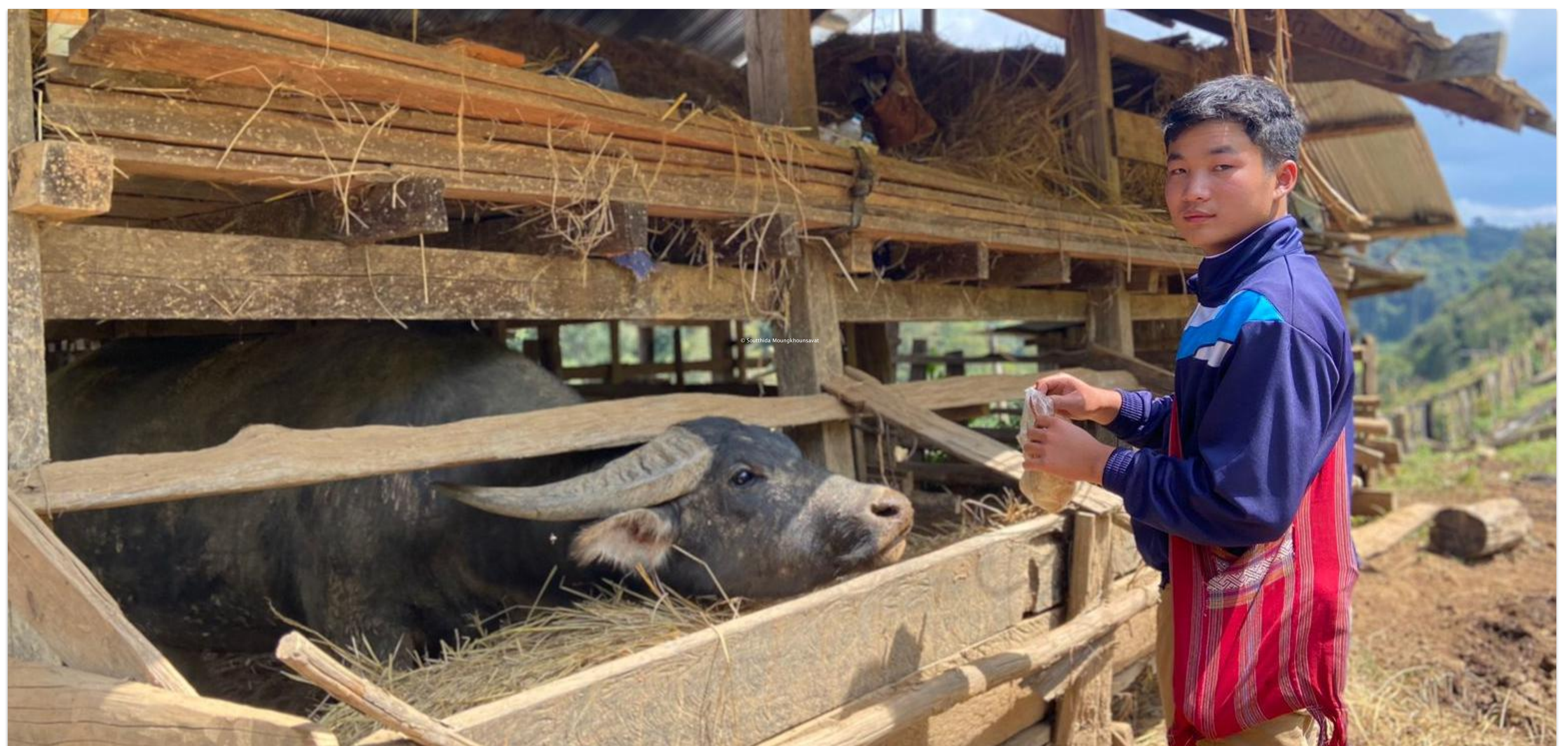
Fig. 2 Young participant to the AGREE intervention with his cattle.