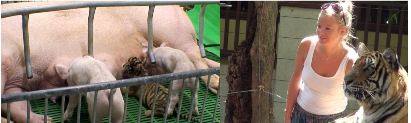
Tiger cubs are removed from their mothers so they can quickly become pregnant again.