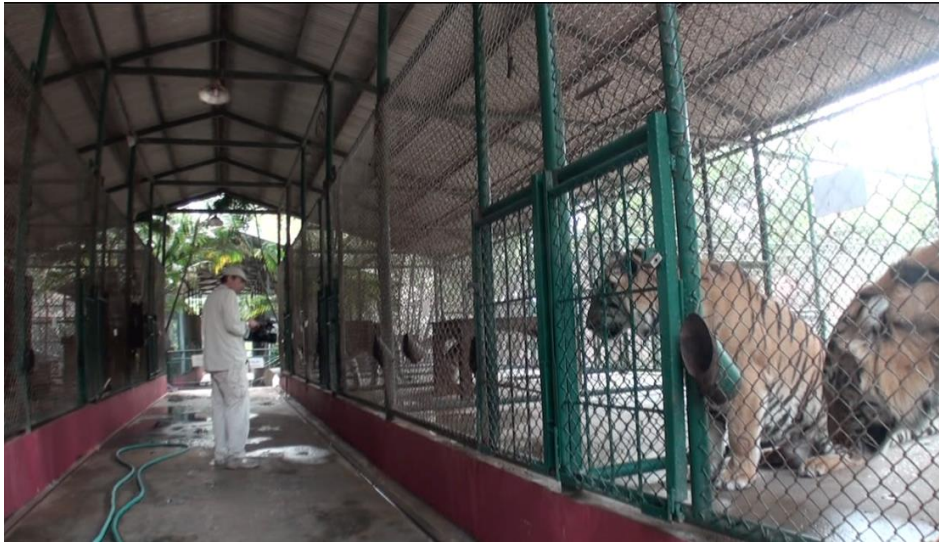
The tiger holding facilities at Ubon Ratchathani.

5. Visiting the zoo in Ubon Ratchathani we found about 50 adult tigers in a facility not geared to tourists or local visitors. The entry fee is very low. This is the very opposite of what is happening in Chiang Mai and Phuket and what will be the case at another such facility now planned for outside Bangkok. Tourist petting set ups earn tens of thousands of dollars a day in Phuket and Chiang Mai. Ubon Ratchathani appears to be a holding and laundering facility close to the Mekong and Lao PDR's border.