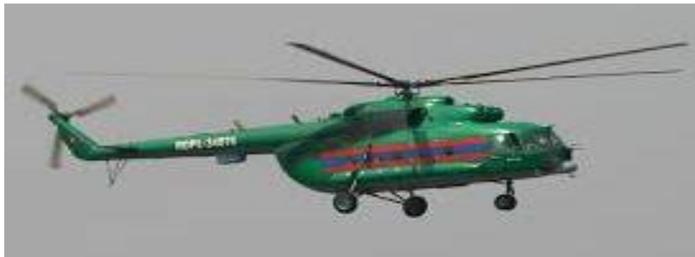
Laotian military helicopters similar to the one pictured are illegally transporting tigers.