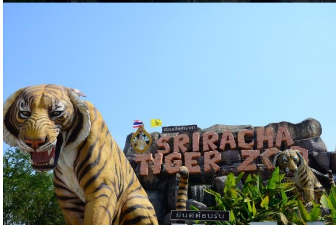
Tiger Tourism facilities are opening thick and fast throughout South East Asia and China