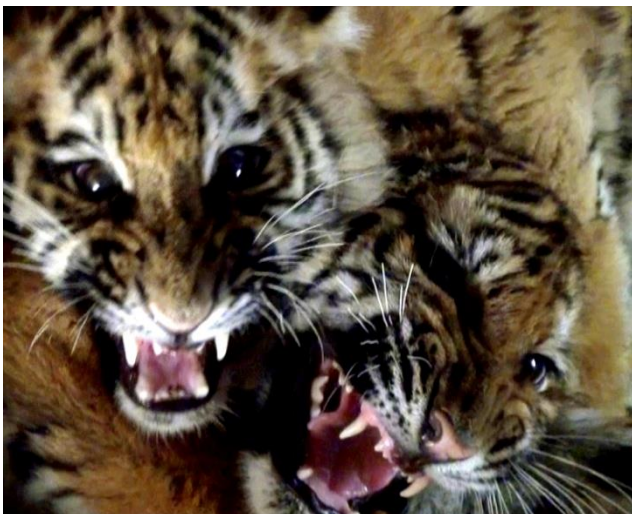
A pair of clearly very terrified and aggressive tiger cubs at Kunming Wild Animal Park.

All tigers and other Asian big cat species are included in CITES Appendix I which bans their international trade for commercial purposes. In addition, the CITES Secretariat has gone on record stating that it considers 'trade' for the purposes of Decision 14.69 as including domestic trade. This is not least because domestic trade has been shown to undermine the international ban, stimulate poaching and significantly threaten the continued existence of tigers in the wild.