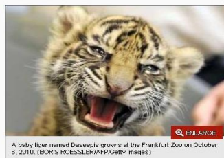
A baby tiger named Daseepis grows at the Frankfurt Zoo on October 6, 2010.