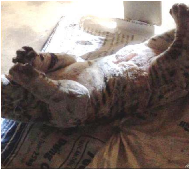
Frozen tiger for sale.

a week. We were told that they could not provide the details of what was injected and to talk to the manager from Ubon Ratchathani (the name was provided) who was a regular visitor and dealt with these issues