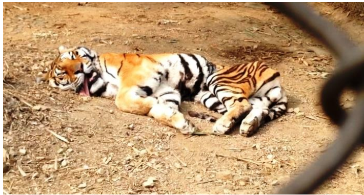
A severely dehydrated and starved tiger in Guilin tiger farm.

7. Our local investigator from Lao PDR asked on hidden camera about purchasing tigers for a new facility at Boten (another casino town in a special zone at the Lao PDR / China border). He was given prices for the adults and the cubs and told where to take them across the Mekong River.