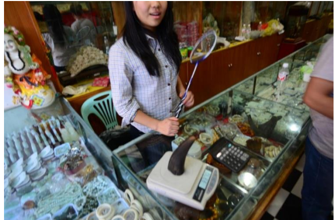
Rhino horn, ivory and other derivatives of animals are common place.

As on many other fronts (e.g. rhino horn, lion bones, primates, python skins etc.) Lao PDR seems to be one of the region's worst offenders when it comes to compliance with the CITES convention. Based on the information collected on this trip, my conclusion is that Lao PDR is in the process of becoming even more established as a place where anything goes, with wide open borders as far as trafficking wildlife into next door China and Vietnam.