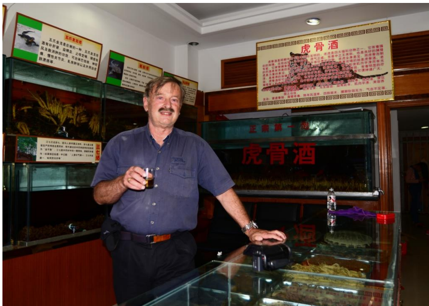
The author with a glass of tiger wine from the tanks in the background. The alcohol has been marinating with tiger bones and ginseng.

The villages along the border closest to the Thakhek tiger farm have developed a cottage industry with tiger cake production facilities just across the border in Vietnam's Ha Tinh province. Those facilities are also boiling down the lion bones legally imported from South Africa into Lao PDR from where they are then trafficked across this international border into Vietnam where they are passed off and sold as tiger skeletons for the production of tiger bone cakes.