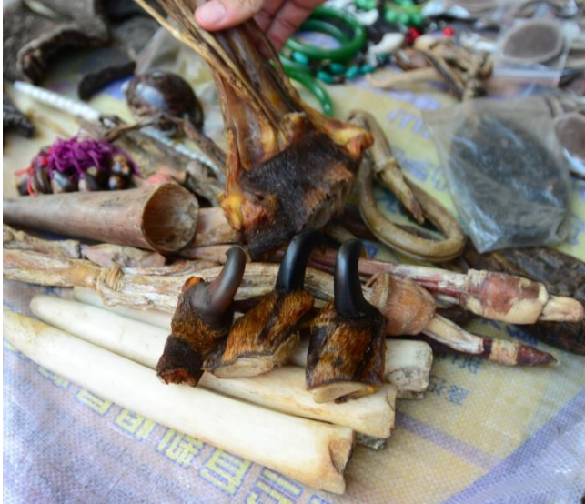
Bodies of evidence: Tiger claws, tiger penis and other endangered species body parts are openly available in the street markets.

It would be relatively easy to check out this information which in turn would help with establishing credibility concerning some of the other key points concerning tiger trafficking which I will outline below. All this is a complete and flagrant breach of the CITES "Tiger and other Asian Big Cat" provisions and presumably also national laws owing to the various promises made by the Tiger Range Countries under initiatives such as the Global Tiger Recovery Program.